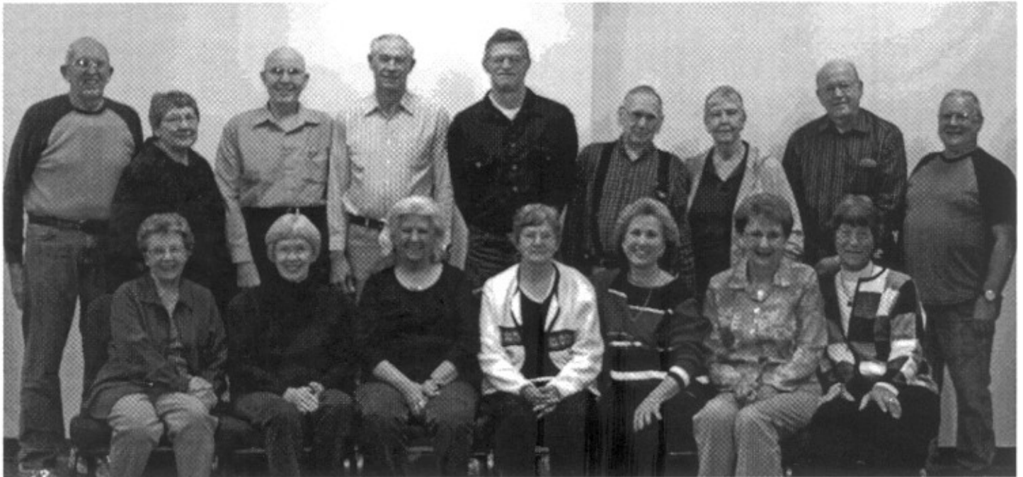
Keller, TX: These are some of the Mission Printing workers from the Keller Church of Christ and Grapevine Church of Christ. These dedicated Christians meet at the Keller church building every Monday morning and work on collating and stapling books that will be sent to souls throughout the world. This is a group that truly is dedicated to "world evangelism by the printed page."